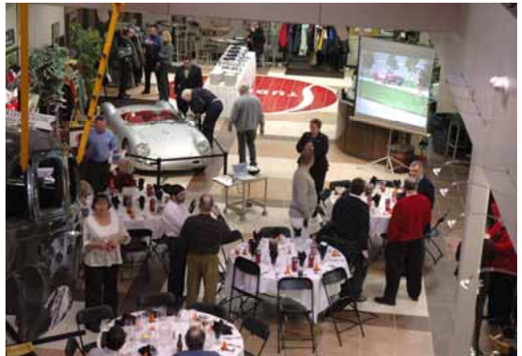
SBR members and guests enjoying the cars, each others company and the great audio/visual display at the 54th Annual SBR Banquet