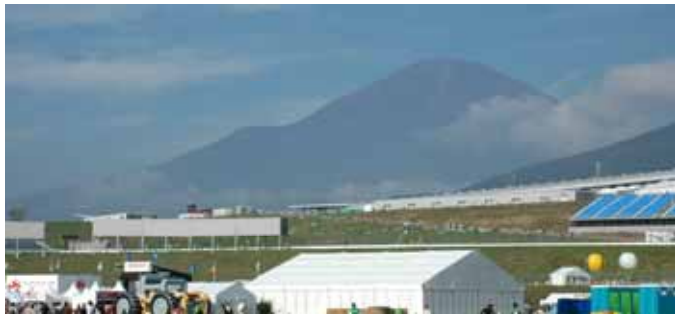
Entering Fuji Speedway—a view from outside, showing some of the vending areas, tents, grandstands and especially Mt. Fuji (Fuji-san) in the background. Kind of cool.

In general, I had a great time, but the weather was miserable. Friday’s practice day was blazing hot and I got sun burnt, and then Saturday and Sunday we were plagued with rain and fog. Despite the first 17 laps being completed behind the safety car, the rain conditions made for an eventful race. Our seats were right in front of the hairpin and chicane, and it was a terrific location to see some good passing and a lot of mistakes.