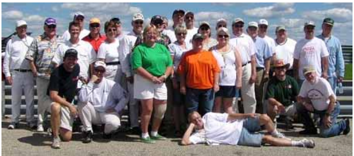
Some of the 34 SBR members who helped make the race a success

We had another great lunch and more great racing in the afternoon. We had a great time and made some new friends.