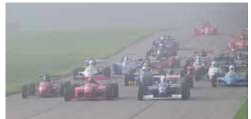
Formula cars in the mist!!

GingerMan making it impossible to start racing until the corner