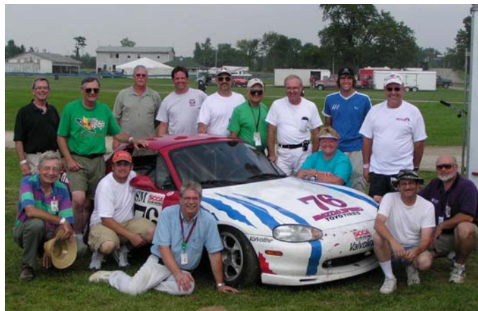
15 hardworking members of SBR take a break during the recent NeOhio/SBR road race held at Nelson Ledges