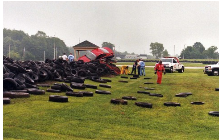
During the NeOhio/SBR road race, this Mustang went off course and begin to flip after going across an access road, hitting the tire wall and eventually coming to rest on and partially in the corner workers station