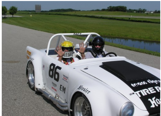
Two participants express their enjoyment of the South Bend Region Solo School