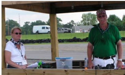
"RE Notes" continued on page 4