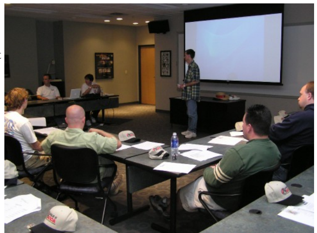
Solo school attendees listen intently during the classroom session