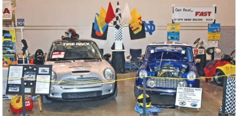
Part of SBR's award winning display

The Cavalcade of Wheels is over, and SBR has made a fine showing. Each of our cars took home a trophy, and our booth took home a prize as well: 3rd place for the best Club display. This means a trophy, and a $300 check! We'll have to put it towards the clubhouse, so we'll have a place for all of these trophies!