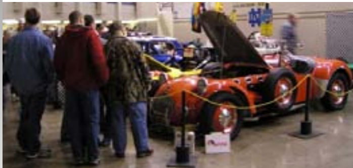
Curt Thew's Allard draws a crowd