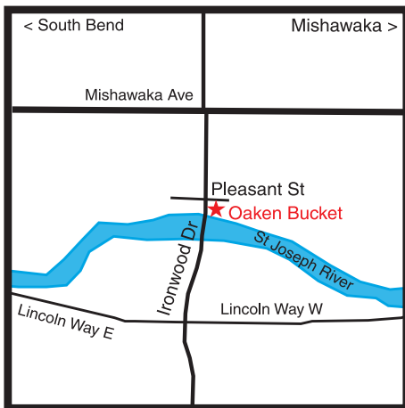
SBR Meeting Site Oaken Bucket Restaurant • 1212 S Ironwood Dr

When: First Tuesday of the month. Where: Oaken Bucket Restaurant Time: 7:00 pm: Board Meeting 8:00 pm: General Meeting Who: All are welcome!