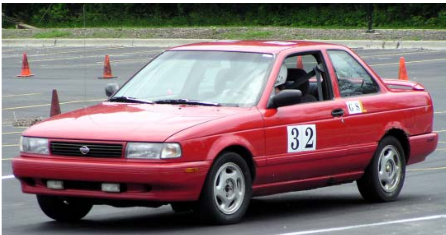
It's impossible to tell which one of the Luckritz family is driving this Sentra SE-R in GS... there were five family members competing that day!

from a road-racer/editor/board member perspective