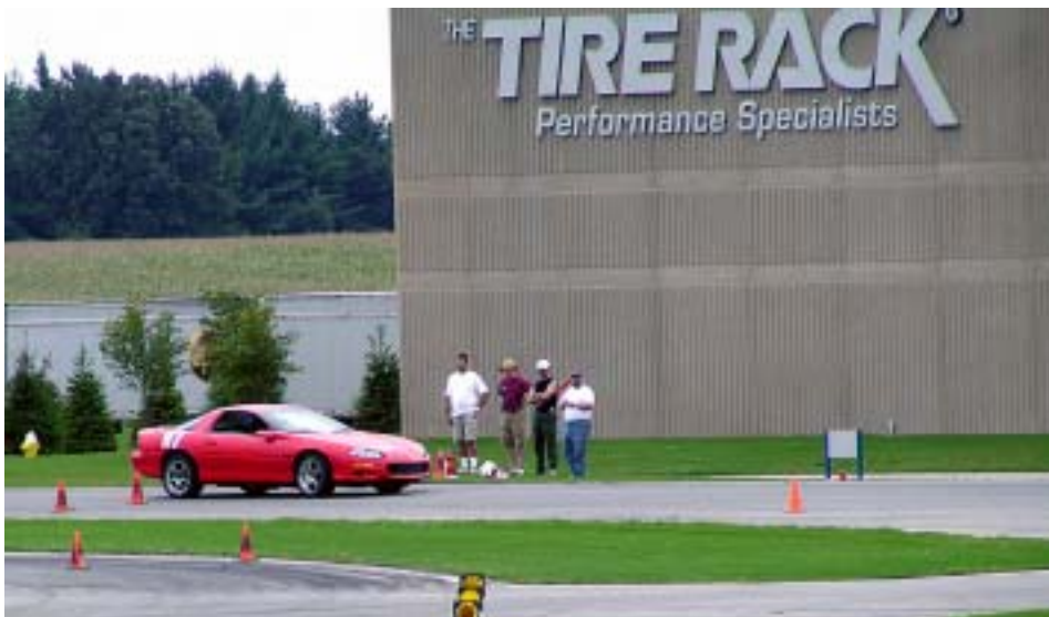
The last Solo II of 2004 was held at the Tire Rack