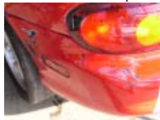
1) A look at the owie

Fast forward to February 2004. Time to fix the damage and there are several options. One is to take the car to a body shop and spend thousands of dollars. This isn't gonna happen. The odds are it's only going to be hit again. Option two is to fix it perfectly myself. Or, I could get out a sledge hammer, bang it from the inside trunk area and get it close to stock. This is the option I choose. While this technique won't win any awards at the Cavalcade of Wheels, it will look pretty decent up close and perfect from the stands! Follow the steps below.