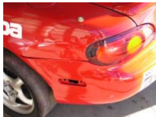
5) The final results look pretty good on paper and OK in real life. Hey, it's a race car.