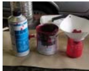
3) I choose a basecoat/clearcoat system using a HVLP spray gun