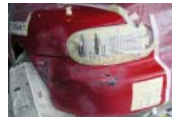
2) Sand boo-boos, and tape