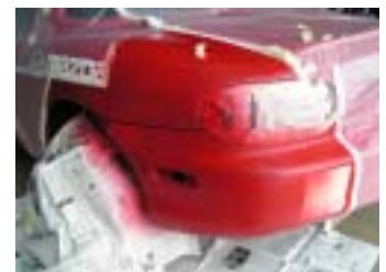
4) Several coats of "miata red" are applied