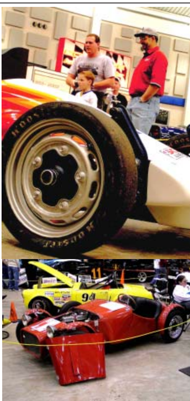
story and all photos-J.Luckritz