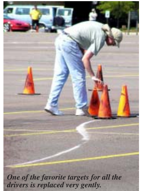
One of the favorite targets for all the drivers is replaced very gently.