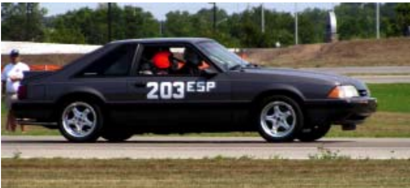
Left-Gary Burton won ESP by a little more than 0.070 seconds.