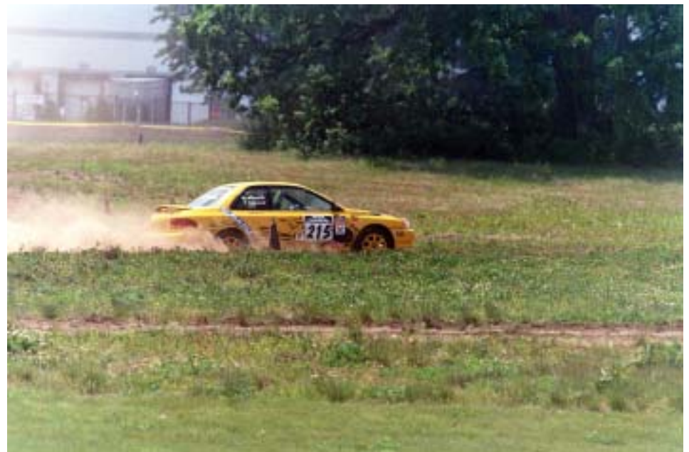
Trailing a plume of dust, one of the RallyCross entrants sets out for a quick run.