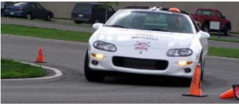
A-T-Top helps Charlie with the headroom problem.