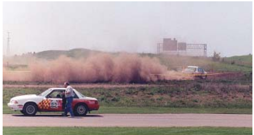
You had to really like dust to fully enjoy the TireRack RallyCross.