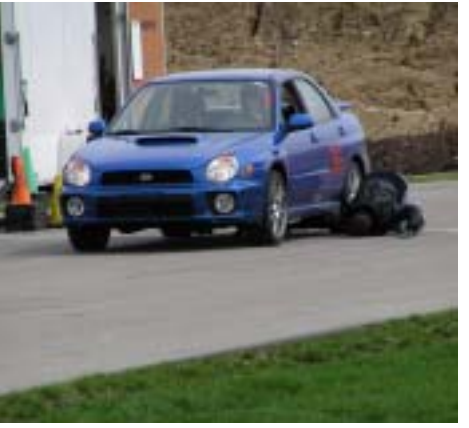
Is Jeff Blanda searching for a tool, money, or pop can he dropped?