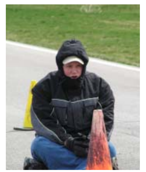
Waiting for a genie or the start? was well received and helpful.