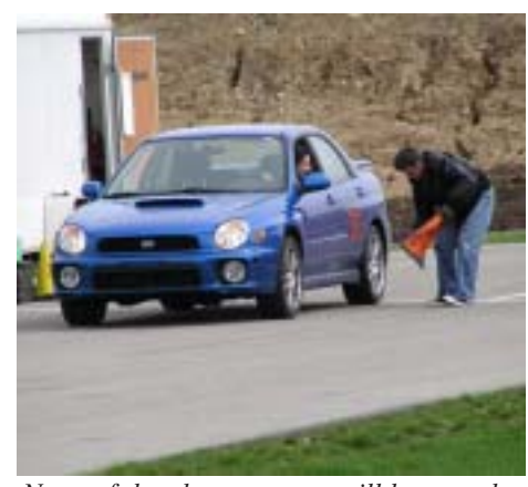
None of the above, a cone will have to do.