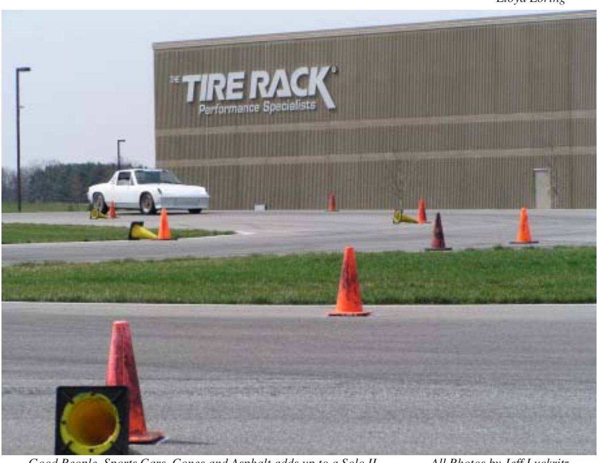
Good People, Sports Cars, Cones and Asphalt adds up to a Solo II