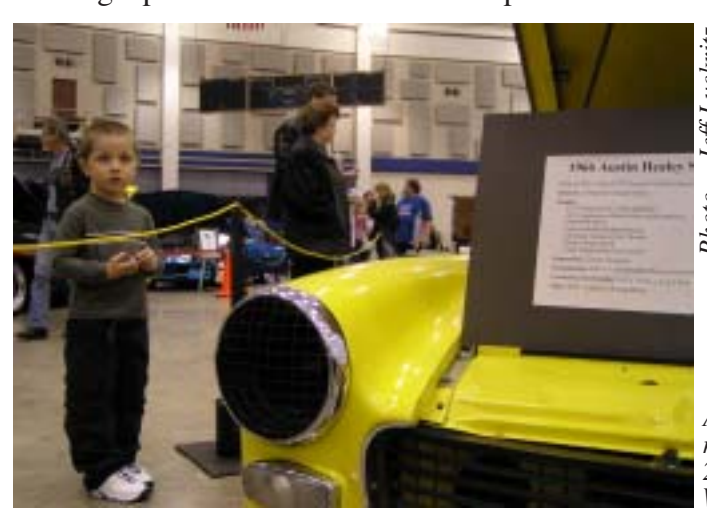
A potential new member looks on at the 2003 Cavalcade of Wheels

And as any experienced worker will attest. You newer corner workers will have your times as well. And I hope they'll all be good ones.