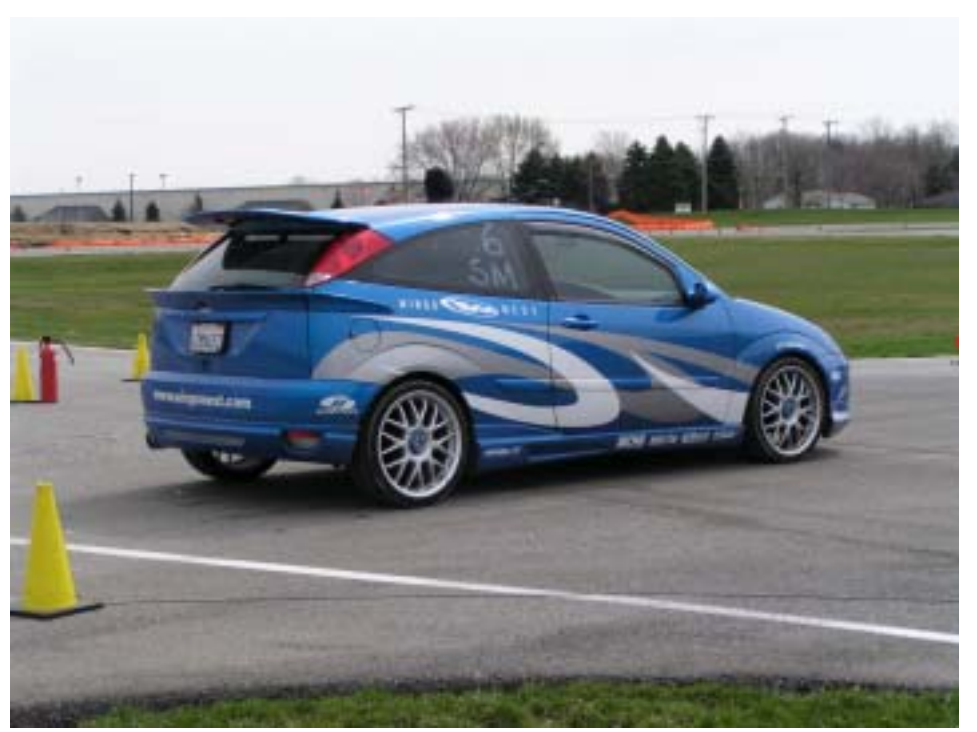
The editor's choice for best looking car of the day.