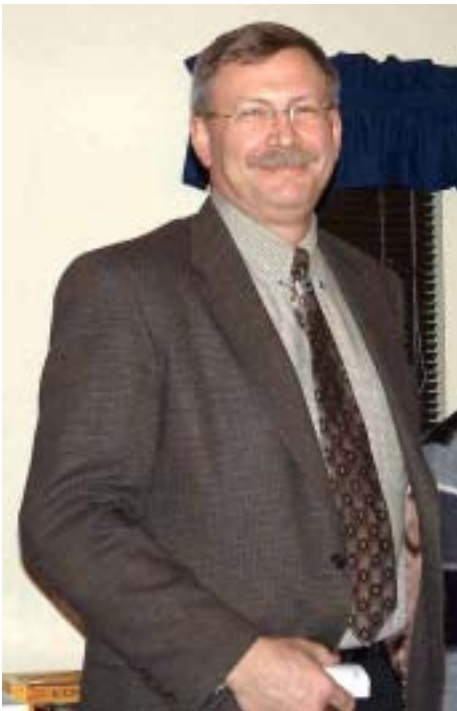
SS Champ-Kent Parkinson