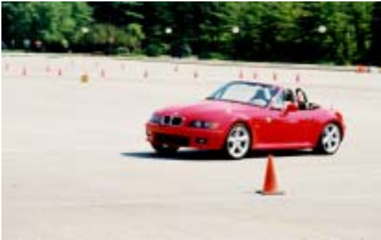
Ahhh! Top-down racing is the only way to go