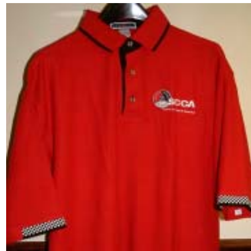
Cool Knit Polo, Red W/Checked Sleeves