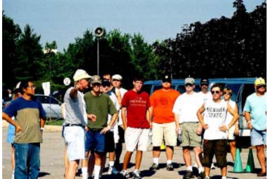
All SBR Solos start with the Novice walk.