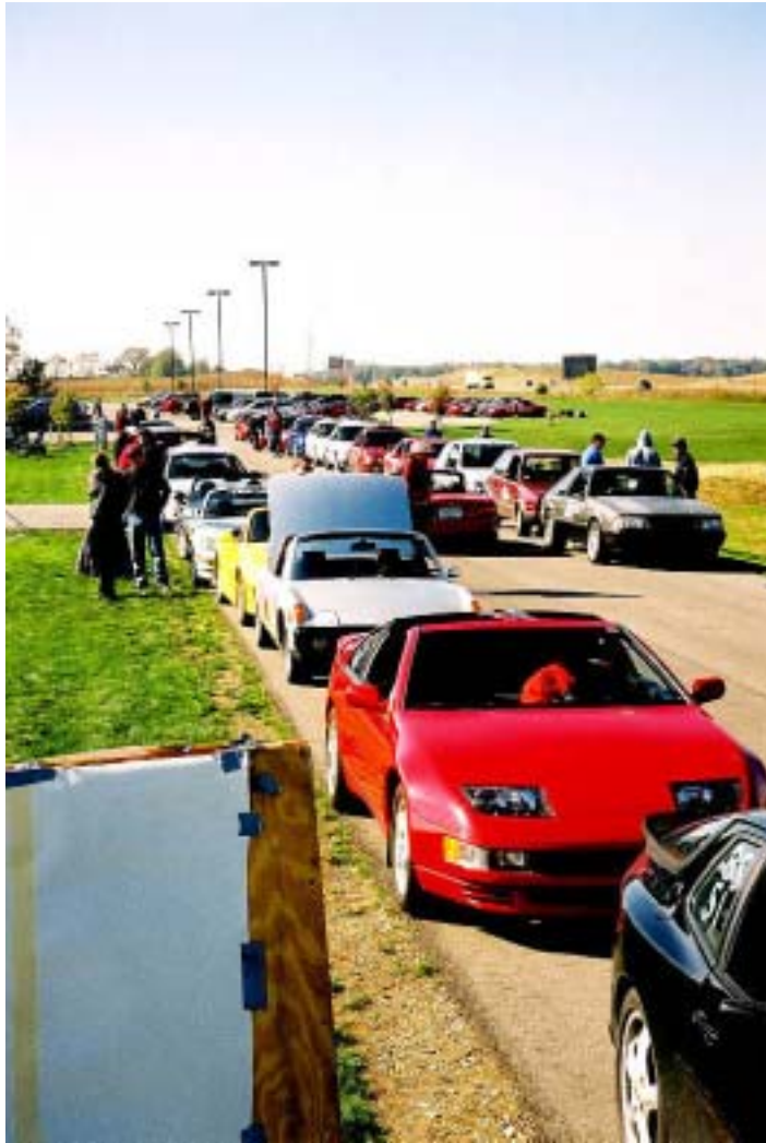
114 entrants showed up for SBR's last Solo

On October 20, 114 solo enthusiasts braved stiff northern breezes and chilly temperatures to test their skills on the TireRack test track for the last SBR Solo II