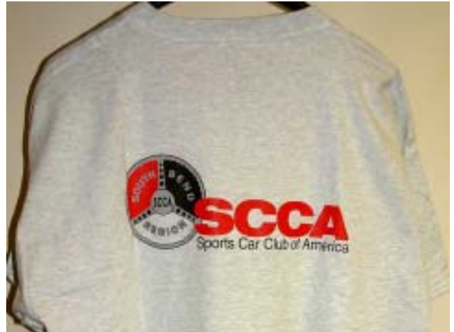
T-Shirt, Grey Logo on back only