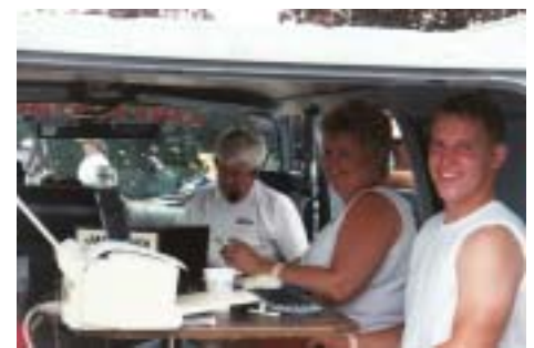
Three cool SBR members!