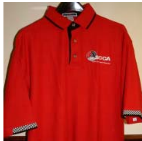
Cool Knit Polo, Red W/Checked Sleeves