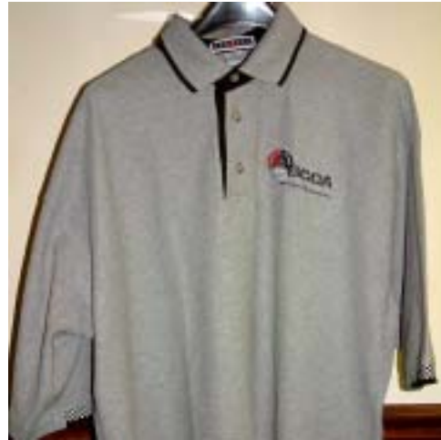
Cool Knit Polo, Grey W/Checked Sleeves