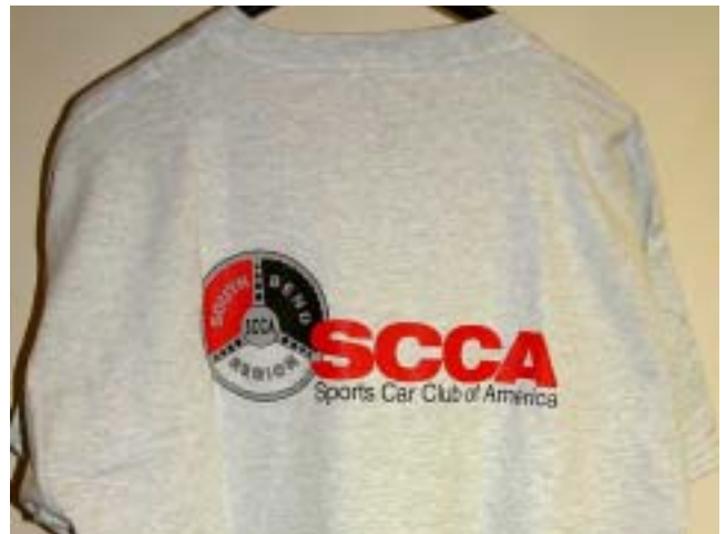
T-Shirt, Grey Logo on back only