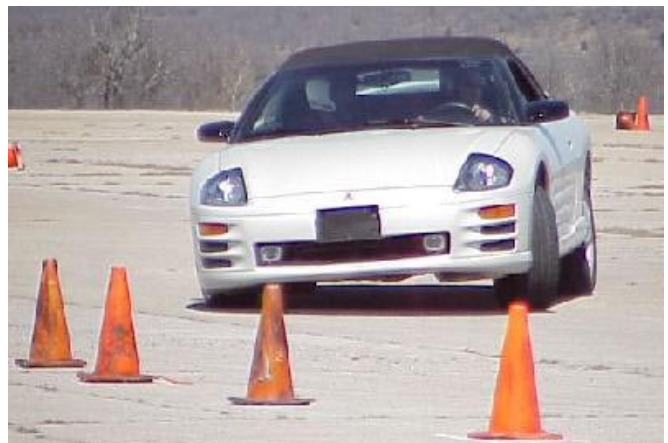
Good thing it is not raining!

A Safe Car, Working Seat Belts, & a A helmet (Loaners are available)