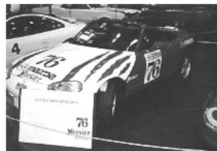
My future SSB Race Car with cool paint!