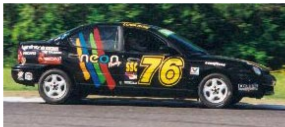
Install safety equipment and go road racing in Showroom Stock.

Indianapolis Raceway Park at Indianapolis, IN, Grattan Raceway near Grand Rapids, MI, Waterford Hills at Pontiac, MI and Blackhawk Raceway near Beloit, WI. SCCA club racing runs from mid-April through October. There will also be a Driver's School for all those budding racers on May 17-19 at GingerMan Raceway.