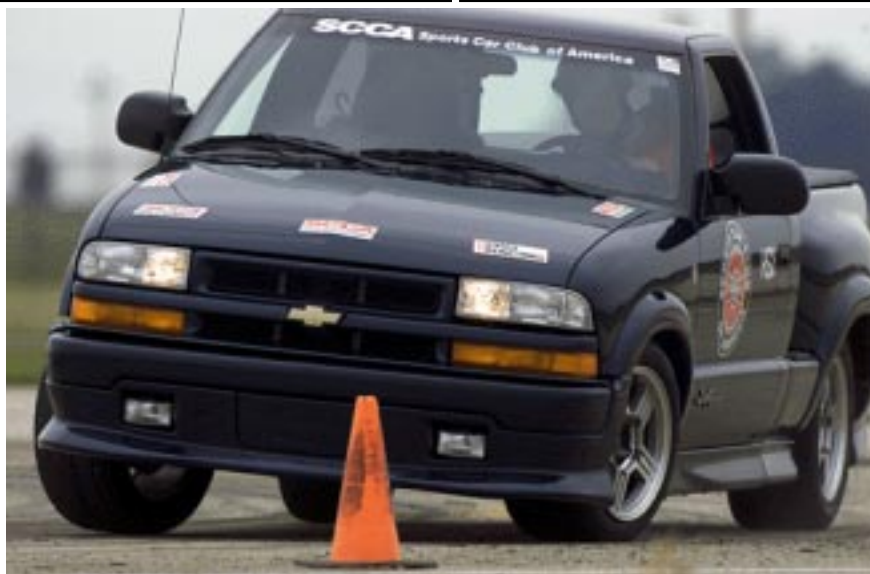
A "Solo Truck" goes through the cones at a South Bend Region Solo.

A Safe Car, Working Seat Belts, & a A helmet (Loaners are available)