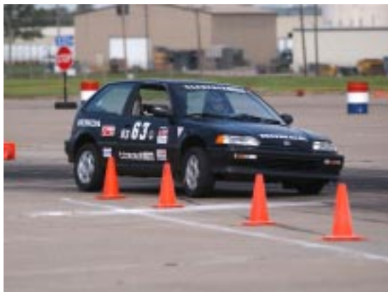
A "unmodified" Honda Civic at an Autocross

Autocrosses (also called Solo II) are held monthly through November. Dates and times are still being arranged. Several sites are being used this year including South Bend and Peru, IN, so check before coming. Registration from 9:30 AM, first car off at 11:30 AM (EST). You need a safe car, effective muffler, seat belt, good helmet (loaners usually available) and the desire to have fun. Classes for all cars. Novice trophy. Special Tire Rack year-end trophies. Guests welcome. Many other autocrosses are staged every weekend from local to National Championship level throughout the Central Division.