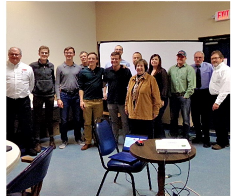
SBR SOLO WINNERS

I am introducing a new cover page for PitBoard this month as you can see.