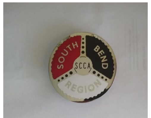
Grille Emblems—Hardware Included