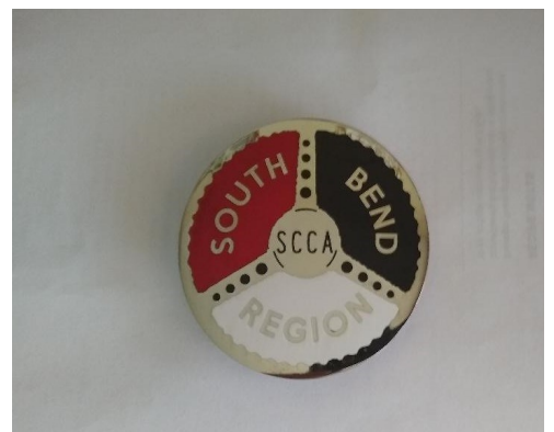
Grille Emblems—Hardware Included