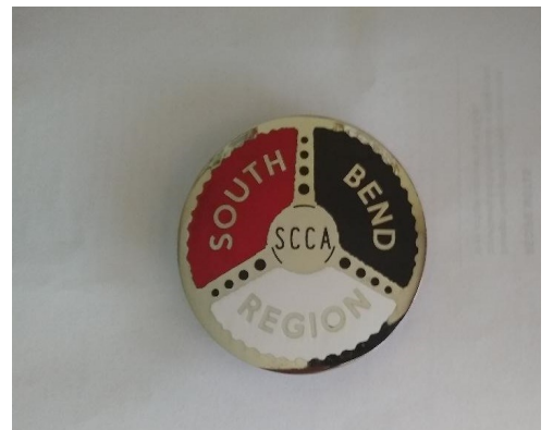
Grille Emblems—Hardware Included