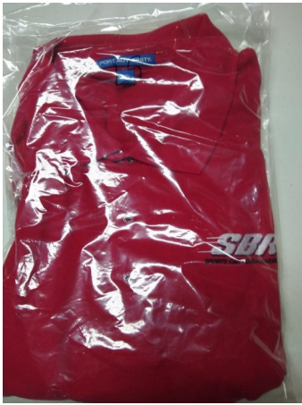
Long Sleeve – L—X L- 2XL— 3XL Short Sleeve—M -L (1 each)

You can email Pitboard with an order and I will get the merchandise to you at an event or a meeting. Items also available at the meetings.