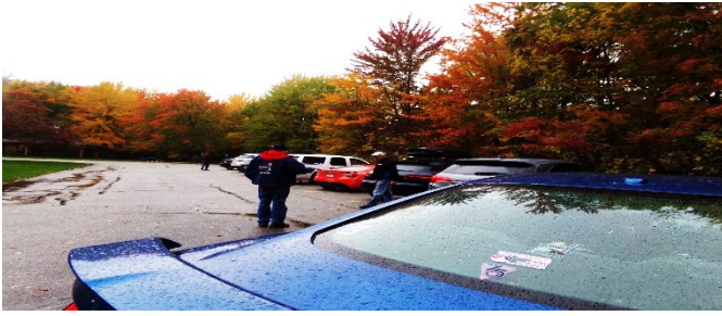
Cars parked at Spicer Lake New Carlisle