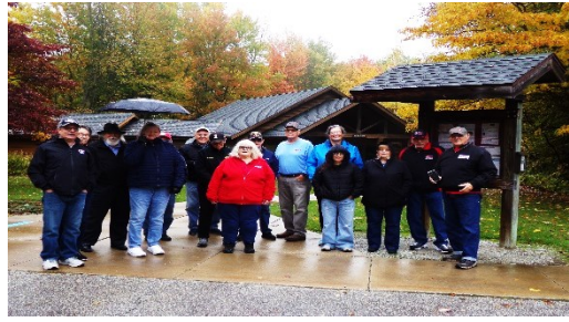
The Trekkers by the info sign Spicer Lake Nature Center behind them Some passengers did not get out