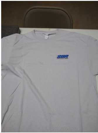
New Gray All Sizes