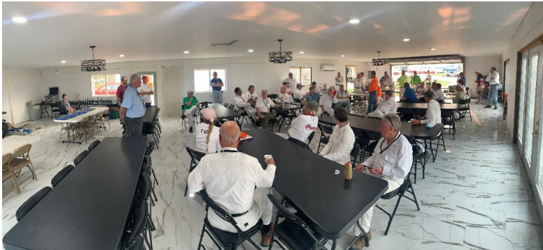
Pre-event corner worker meeting