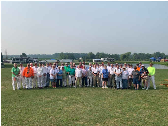
Almost all it takes to run a race