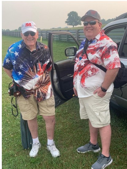
The Arizona Connection