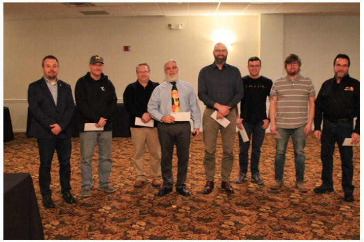
Tire Rack Index Winners