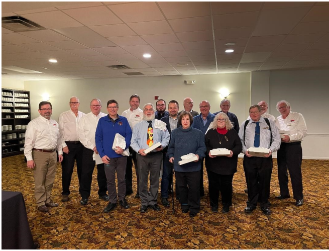
TOP TWENTY AWARD WINNERS