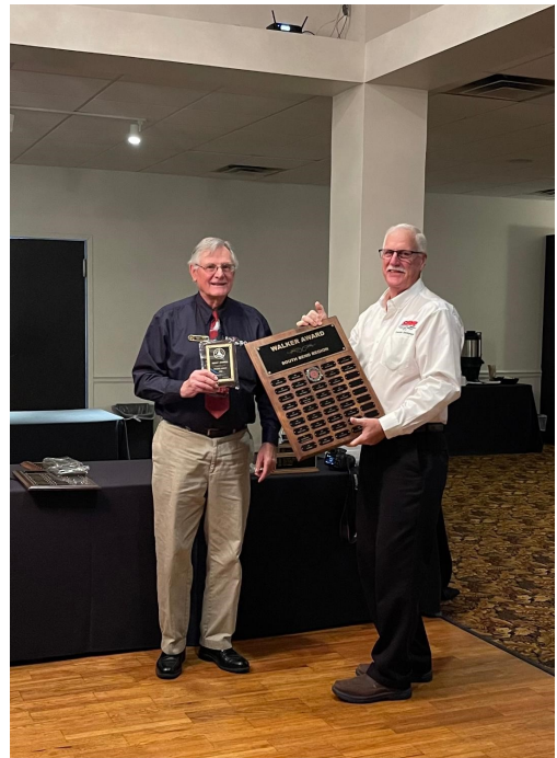
Me receiving the Walker award