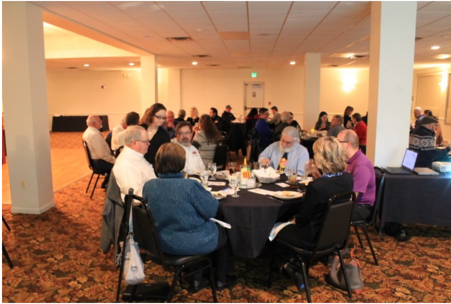
EVERYONE ENJOYING DINNER