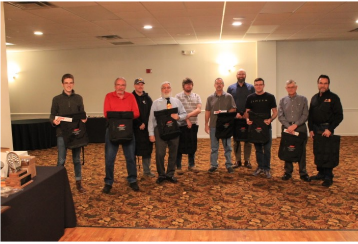
Solo Class Winners from 2022