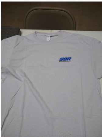
New Gray All Sizes