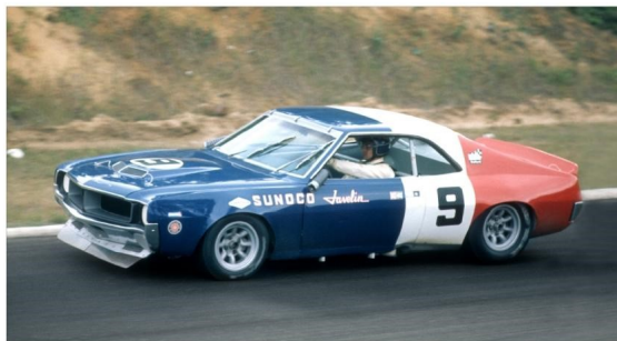
ST. JOVITE TRANS-AM AUGUST 6, 1970 AMC JAVELIN PETER REVSON