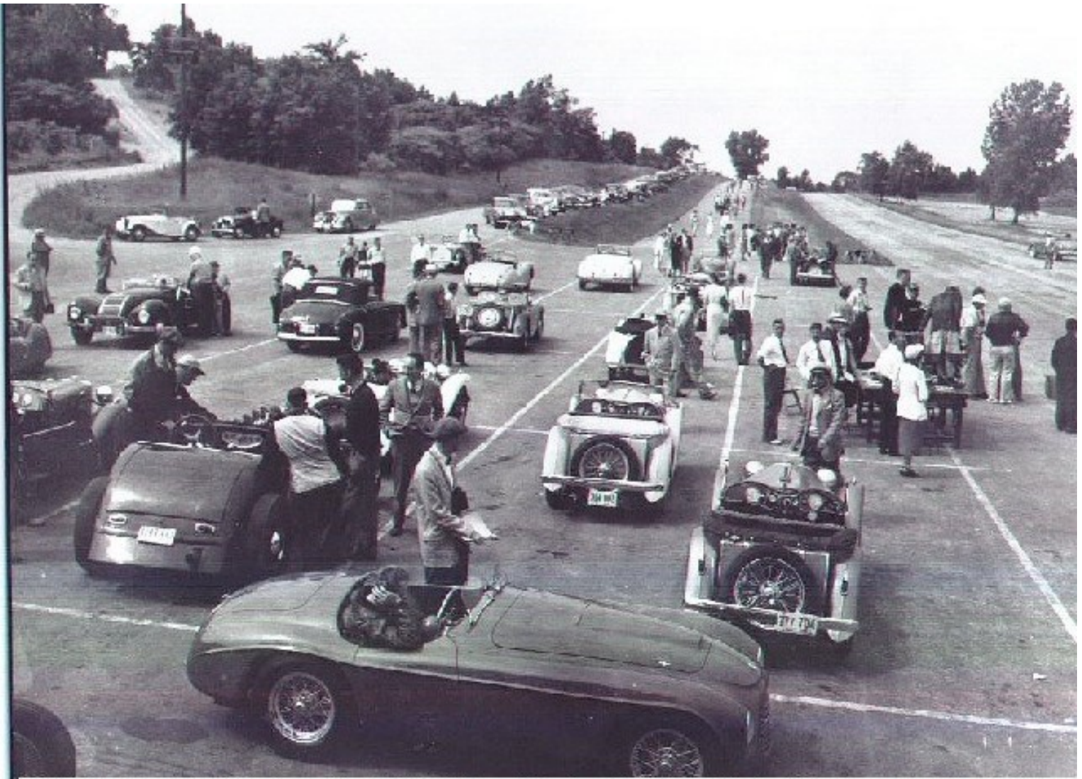
The Beginning Of Sports Car Racing in the USA. The 2nd of 4 Races held on June 23, 1950 at Studebaker Proving Grounds South Bend, Indiana

This is a picture that someone passed on to me some time back. It is the beginning of road racing in our area even though it was put on by Chicago Region. It is too bad we don't have some connection to the company that now owns the facility. It could possibly be an interesting solo site.