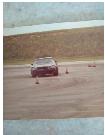
1977 Camaro Z-28