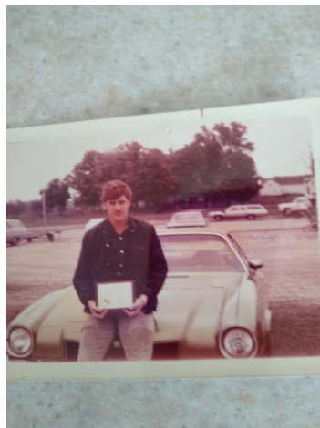
1971 Camaro SS