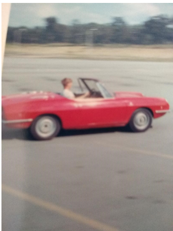
Fiat 850 Spyder