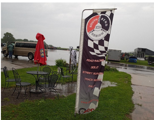
The weather isn't always the best