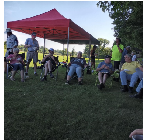
Friday Night workers party