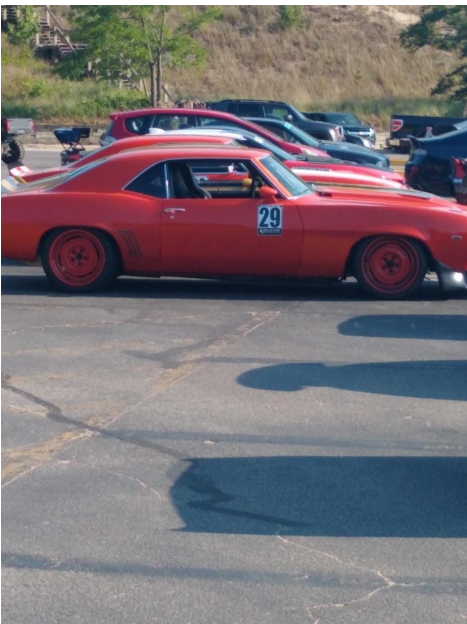
Very Fast Car

ps- See story about our Majors race elsewhere in this edition