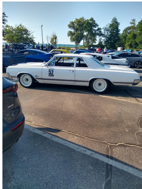
Wheels of Steel