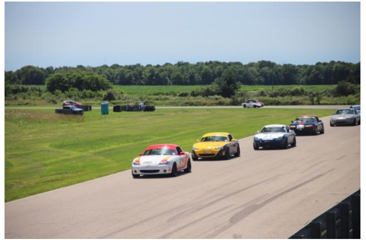
Start of Spec Miata Race