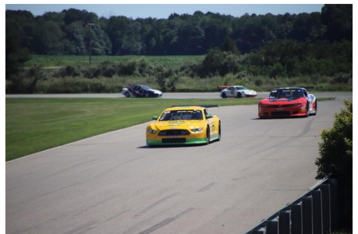
More Big Bore Cars