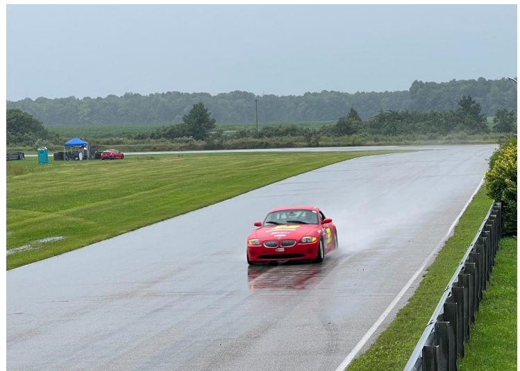
Little Lonesome on Sunday morning