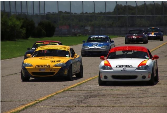
More Spec Miata