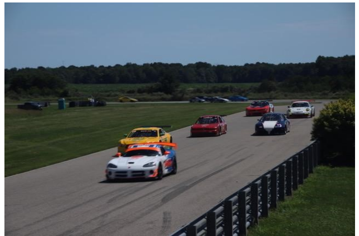
Start of Big Bore Race