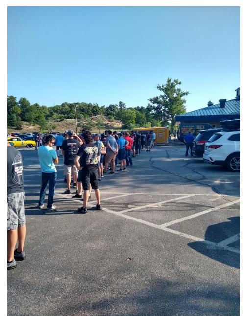
Line for food truck