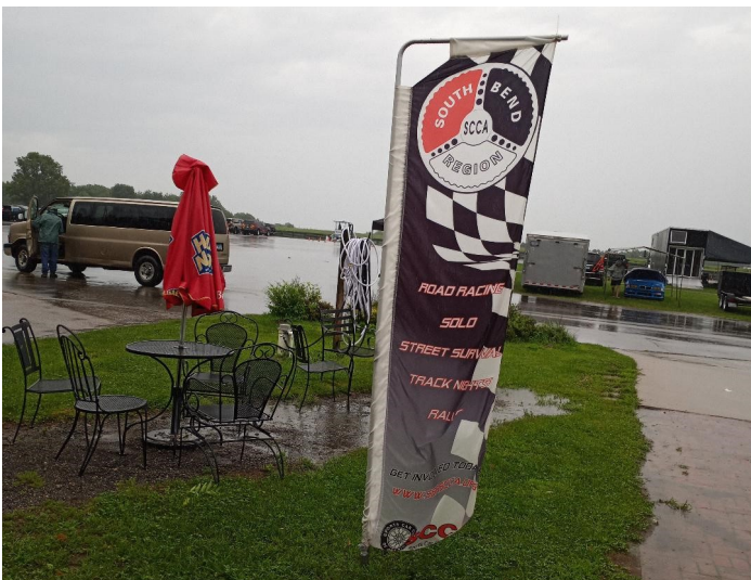
Sunday Morning at the Track