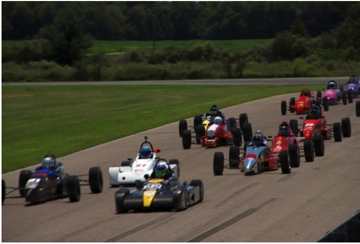
Start of Small Formula Cars