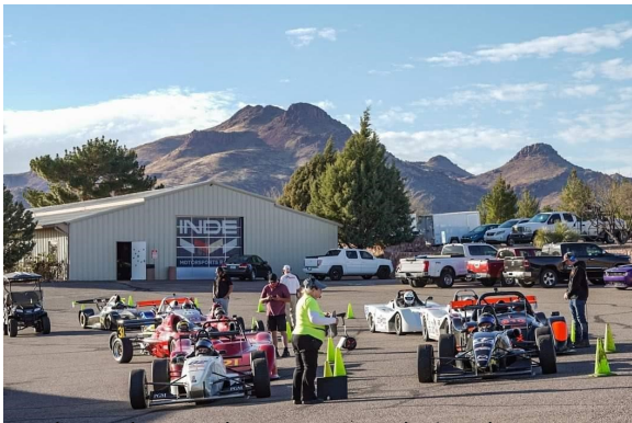
The grid area. There was no splitting the groups.