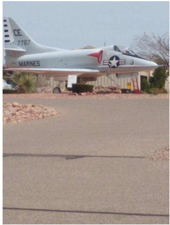
Also an museum of war aircraft