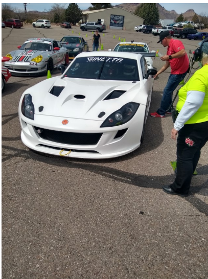
There were some interesting cars