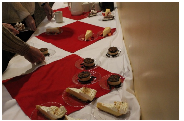
POPULAR DESSERT TABLE