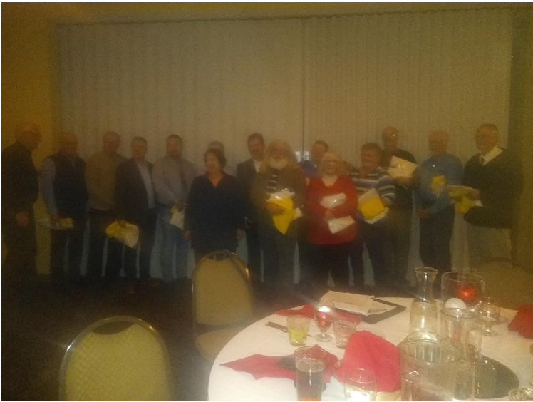
TOP 20 WINNERS