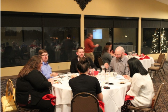
A FEW SOLO WARD WINNERS