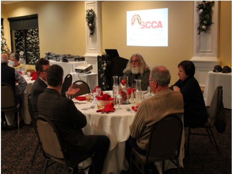
WAITING TO BEGIN