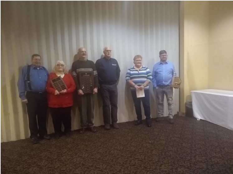
TRAVELLING AWARD WINNERS