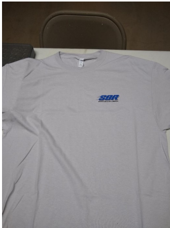
New Gray All Sizes