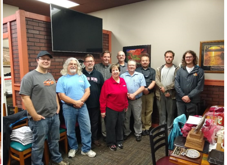
Solo Winners that were present