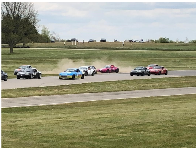
Action from Spec Miata in turn 1 at the start.