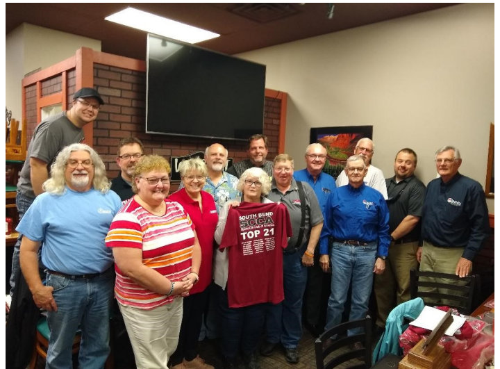
Top twenty-one point winners for 2020