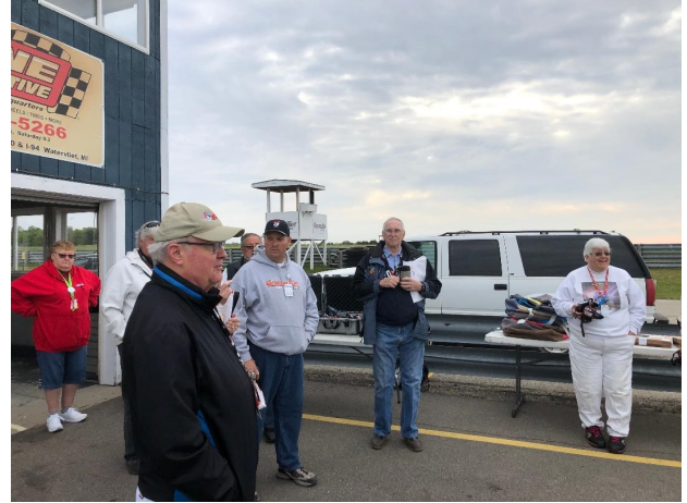
H.C. instructing at the corner workers meeting.