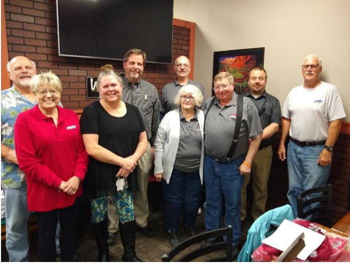
These are the annual award winners

Here are the award winners that were present at the May Membership Meeting on May 4, 2021