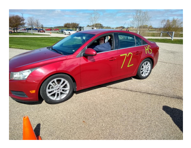
Art Reynolds shows you can run anything

On April 25 about 63 drivers gathered at the Tire rack to have a chance to see if they still posses the skills it takes to win at the autocross game. It was in the low 40's with a wind that wouldn't let up (brrrr!!). Once again it seems like we have a great crew that put these events on. The runs went by very quickly and everyone was gone by around 3. Some pictures of our competitors are below. Winners were awards their trophies and then went home to get warmed up. Unfortunately results haven't been posted as of this time but will be soon.