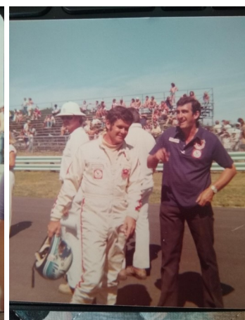
Al Unser Jr F-5000