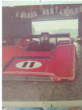
Can-Am racing at Road America