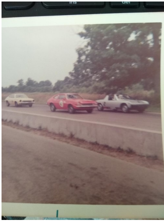
SBR Regional at Blackhawk