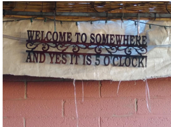
Time was not the issue