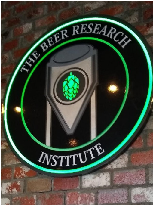
It was a learning experience