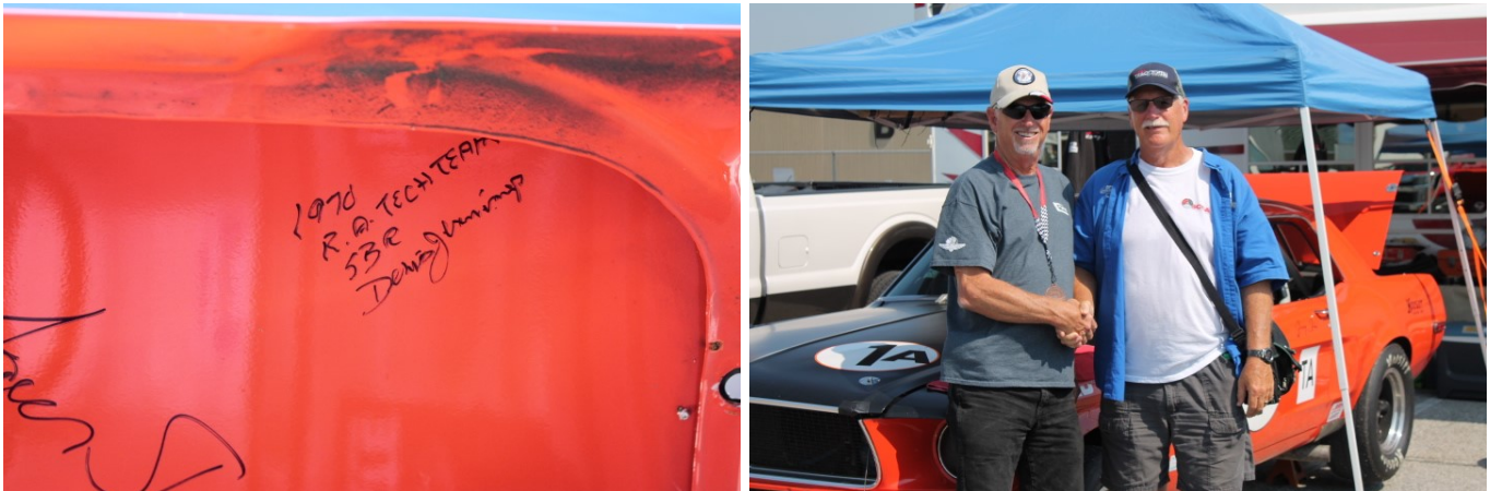
Pictures of Indy Vintage racing weekend. The guy even had me sign the inside of the trunk along with others he had sign.

THIS COULD BE YOUR ARTICLE. Send me something and we will print it as long as it pertains to the club.